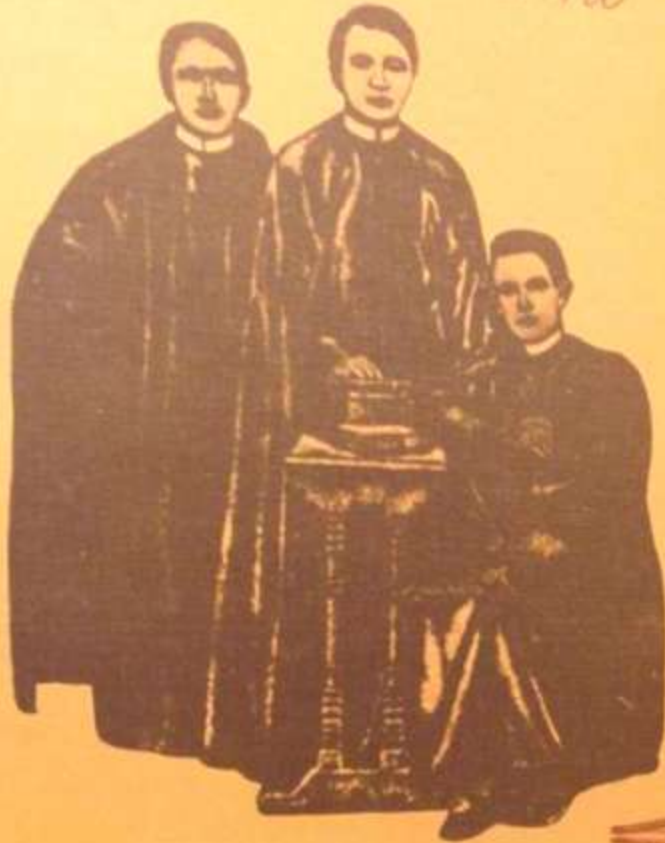
PADRE BURGOS, GOMEZ Y ZAMORA

Rizal dedicated El Filibusterismo to the three martyred priests of Cavite mutiny. The execution of the three priests was significant to the title of the novel.