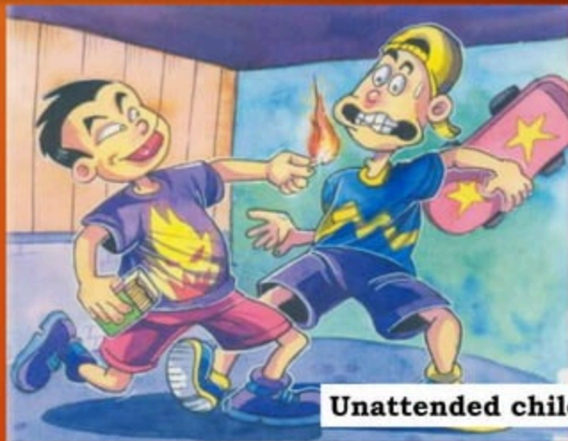
Unattended children playing matches