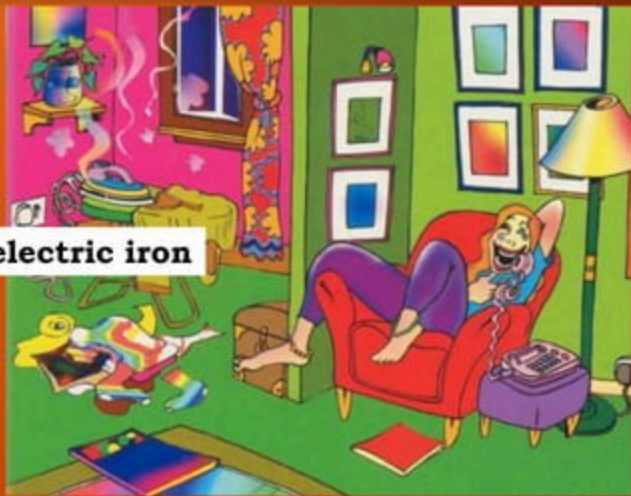
Unattended electric iron