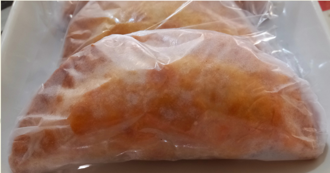
Wrap with glassine paper

Individual wrap of glassine and ice bag plastic, sealed.