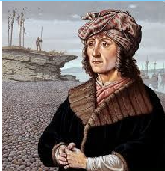
Antonio Pigafetta (Lombardo)

“... [From Humunu, we] took the course between west and southwest, and passed amidst four small islands, i.e., Cenalo, Pluinanghar, Ibusson, and Abarien.