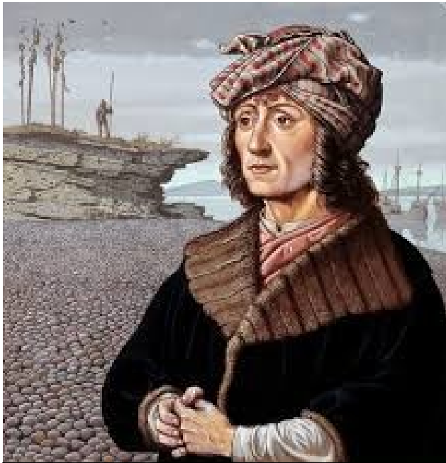
Antonio Pigafetta (Lombardo)