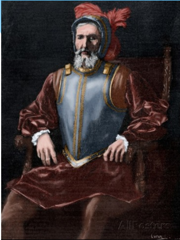
Miguel López de Legazpi