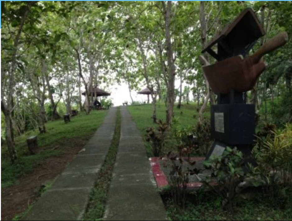
in Pinamanculan Hills, Butuan City

“The significance of Pinamanculan Hills cannot be taken for granted, especially now that it has been established that [the area] used to be an island.”