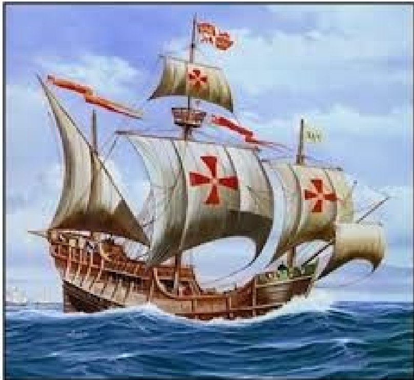
a Spanish caravel

“... [They] came to anchor at another island, which is named Macangor, which is in 9 degrees ; and in this island they were very well received, and they placed a cross in it.”