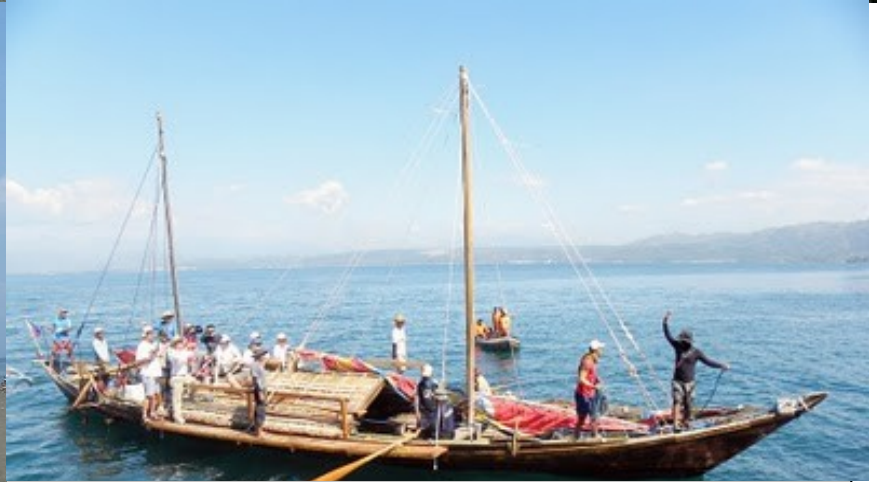
The seashore today in Masao and a replica of the balanghais.