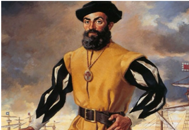
Fernão de Magalhães Fernando de Magallanes Ferdinand Magellan

“... On Sunday, the last day of March, and feast of Easter, the captain sent the chaplain ashore early to say mass ... When it was time for saying mass the captain went ashore with fifty men, ... dressed as well as each one was able to dress ... [W]hen the offertory of the mass came, the two kings went to kiss the cross like us....”