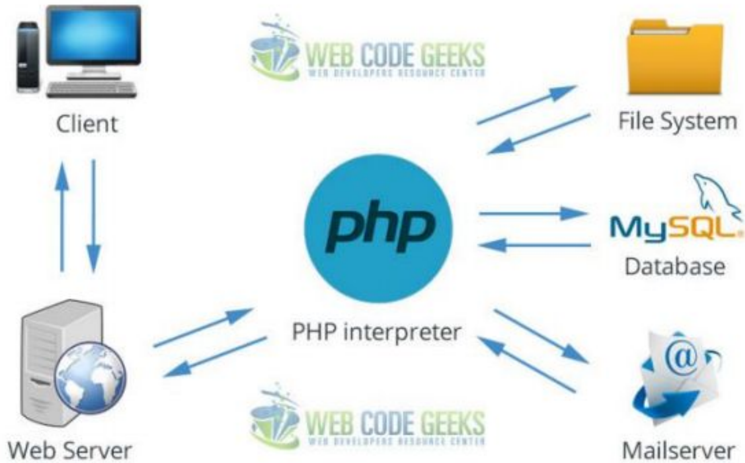
Figure 1.1: PHP Dynamic Content Interaction