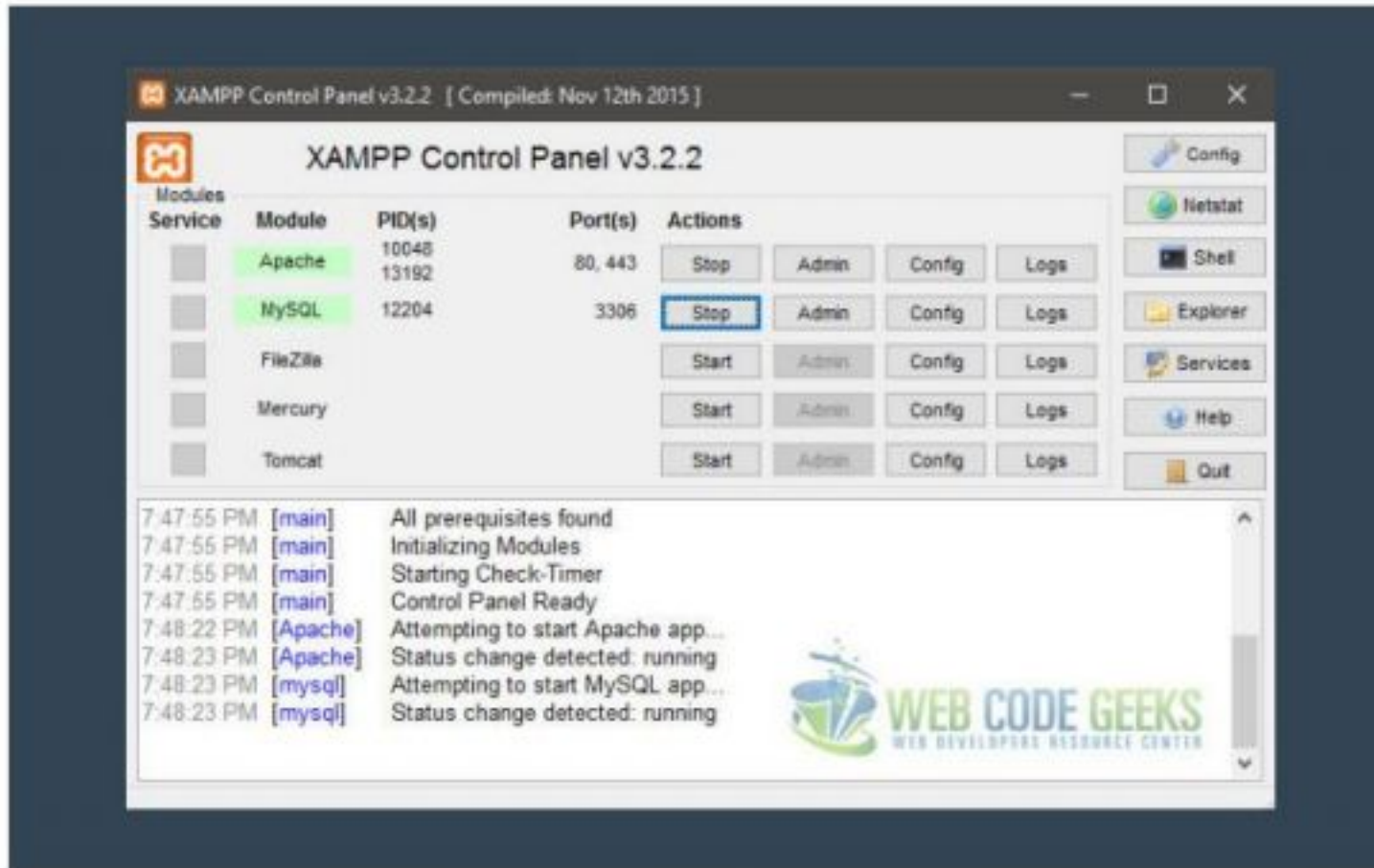
Figure 1.2: XAMPP window after a successful installation with Apache and MySQL enabled